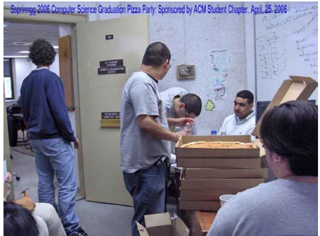
Spring 2006 Computer Science Graduation Pizza Party, Sponsored by ACM Student Chapter, April, 25, 2006